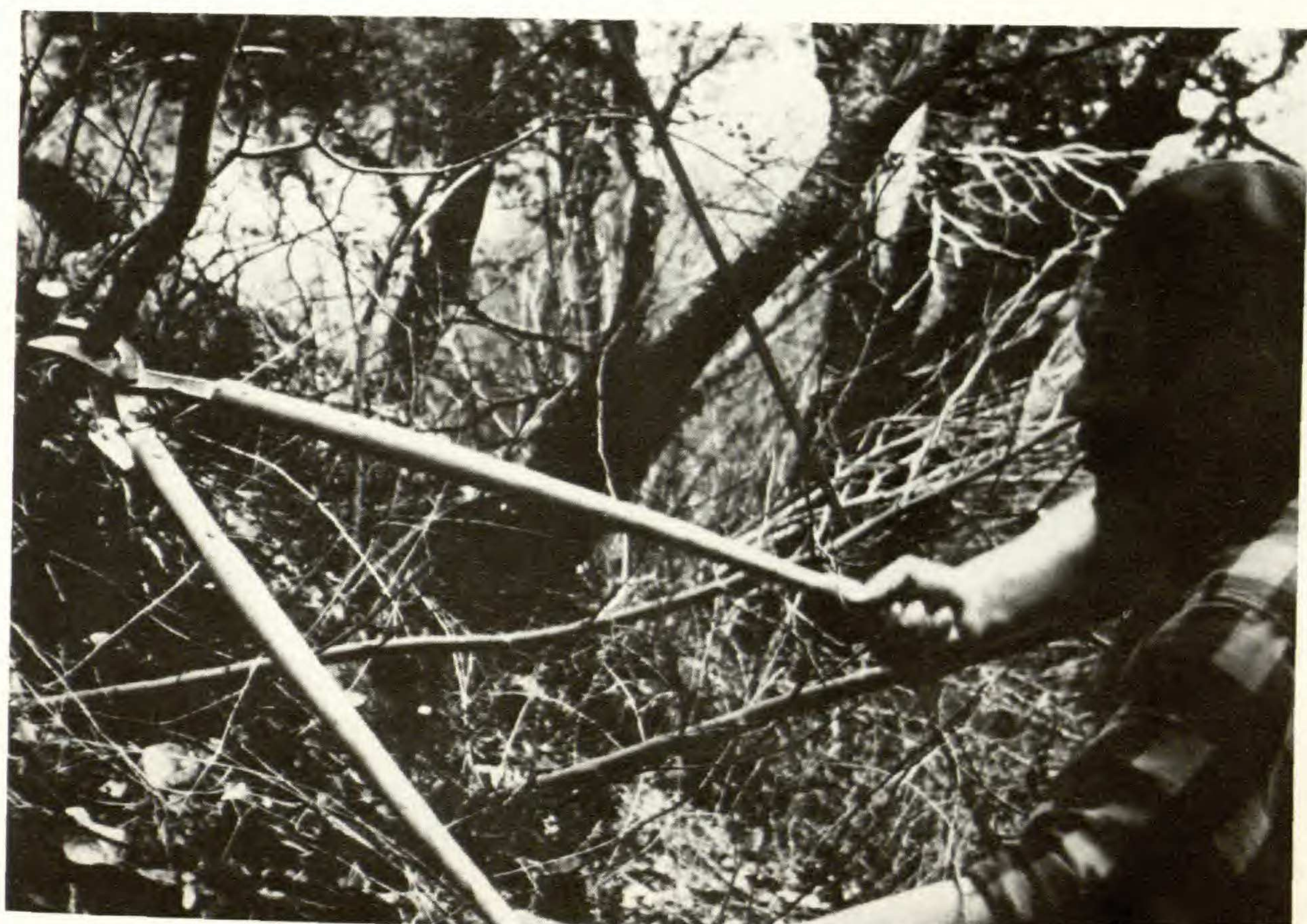
FIG. 2.—Coppicing redbud to induce rapid elongation of sprouts the following year.

characteristics most valued by the Southern Sierra Miwok and other California Indian peoples for basketry material (Fig. 3). Consistent, frequent pruning also keeps redbud shrubs of a smaller stature, with many slender boles that are easy to reach and cut, saving the basketweaver harvesting effort and time. In contrast, wild redbud has grey bark and twisted branches that are forked and often brittle; where the branches fork there is a notably more fragile area, making this section unsuitable for basketry.